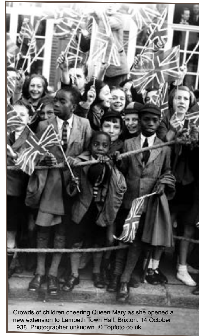
Crowds of children cheering Queen Mary as she opened a new extension to Lambeth Town Hall, Brixton. 14 October 1938.

Changing The Story centres an overlooked strand of British history, through a series of striking photographs documenting British life from 1917 to 1962.